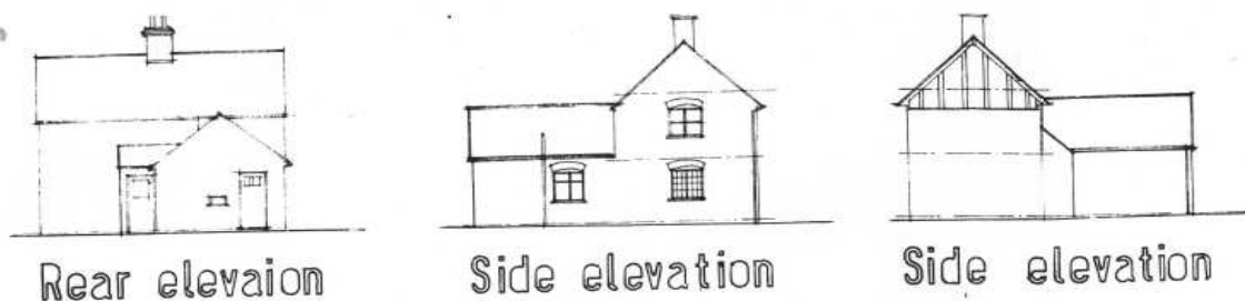
Original elevations (pre 1948)

5.10 The original elevations and floor plans i.e. pre 1948 are set out below to assist Members in their assessment of whether the proposed extensions represent disproportionate extensions, over and above the original house. In addition, the proposed ground floor plan is laid out next to the original to show original rear walls and the remaining potential (hatched) for single storey rear extensions under permitted development. For information the remaining (un-hatched) area of the proposed rear extension would constitute an extension extending 8.2m beyond the line of an original rear wall.